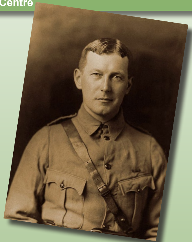
"John McCrae in uniform circa 1914"