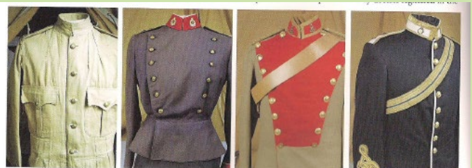
Distinctive uniforms of the Canadian Contingent